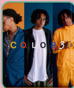
"Colors" | The Third