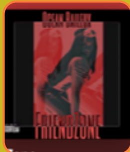
"Friend Zone" | Ocean Baileux