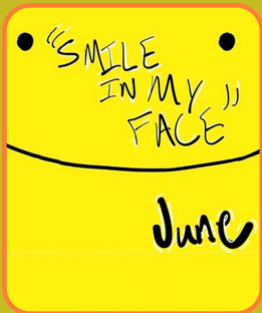
"Smile In My Face" | June